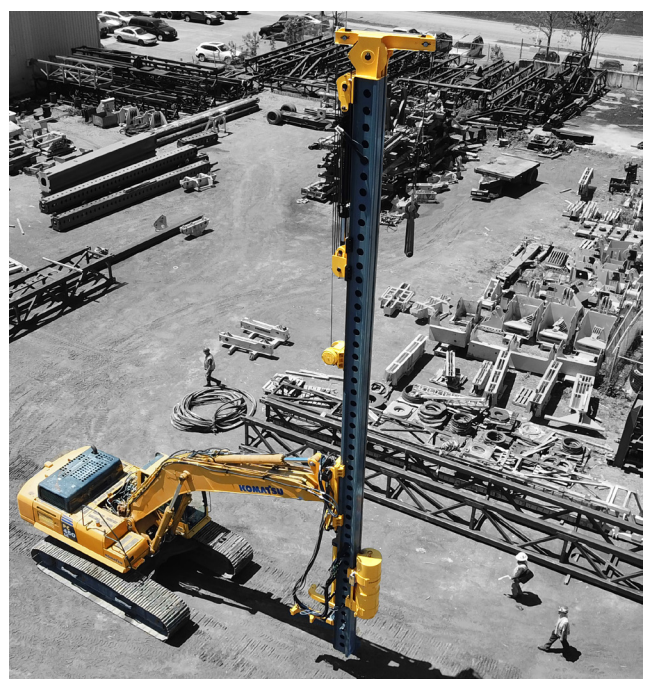
EML45 System Shown